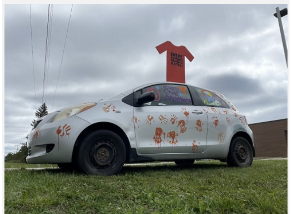
"Orange Shirt Car" designed by Grey Highlands Secondary School students and staff

On September 30, 2021, Canada observed the first ever National Day for Truth and Reconciliation, which coincided with the annual tradition of Orange Shirt Day. In Bluewater District School Board, flags were lowered at schools and work sites, while students and staff wore orange and participated in Truth and Reconciliation activities throughout the week. From collaborative whole school art projects and traditional ceremonies, to drama presentations and guest speakers, students were involved in many creative and thought provoking initiatives. Staff also engaged in various learning opportunities, including a live virtual presentation with educator and writer Dr. Niigaan Sinclair on how we can influence and empower through education, and be an ally. This occasion was just one opportunity to broaden our learning and understanding of the long-lasting damages of the residential school system on Indigenous Peoples and communities, and to honour victims, survivors, and others who have been impacted. View our web article.